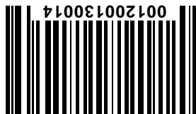
code 128-C 180°